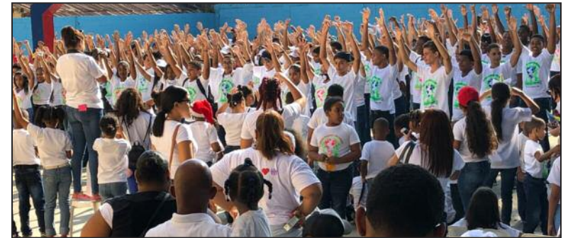
Students at an assembly in Colegio Episcopal San Andrés in Santo Domingo.

The Episcopal schools in the DR have a well-deserved reputation for serving segments of the population most in need. A number of these schools rank among the finest schools in the nation. Many children’s lives have been transformed by an Episcopal education like the one provided by Colegio Episcopal Todos Los Santos in La Romana. For example, a lawyer, her chemistry professor brother and their oldest sibling, an Army Colonel, spent childhoods in a “house” without running