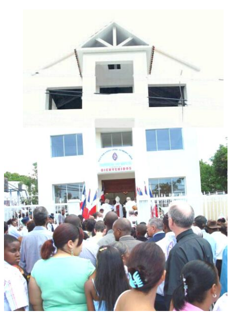
Boldly building for the future.

Since its incorporation in late 1998 the Dominican Development Group (DDG) has played an important role in the development and self-sufficiency of the Dominican Episcopal Church, transferring over 4.1 million dollars to help fund its dynamic growth. This has included funds for infrastructural projects (churches, schools and shelters), scholarships for children in Episcopal schools, various other support programs as well as the first major contribution to the Endowment. Given the DDG's 501 (c) (3) status, people of faith and good will can contribute to the DDG for the Endowment of the Dominican Episcopal Church. Administration of the DDG is supported by other means thus enabling 100% of contributions for the Endowment to go directly to the Endowment.