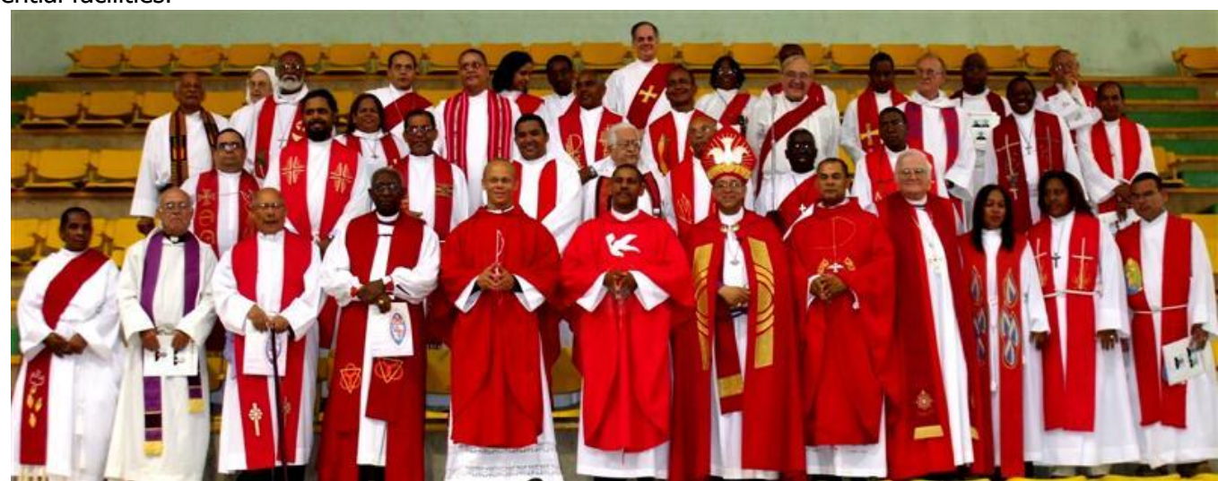
Dominican Clergy at Diocesan Convention - 2008

Income from the Endowment will provide for more adequate clergy salaries as well as support for the increased number of clergy needed in this rapidly growing Diocese, and for infrastructural investment to meet expanding needs. For example, even though the cost of living is high, at this time a priest's entry level salary is $600 per month plus housing and benefits. Priest salaries do increase with seniority but they are still inadequate. With such limited income, Dominican priests sometimes leave the DR for Hispanic ministry positions in the US where salaries are much higher. Over time the Endowment income will allow the Diocese to catch up with the need for new churches, schools, medical clinics, clergy housing, and other essential facilities.